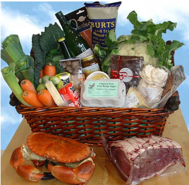
Christmas Hamper of Local Produce

The incentive for responding to this questionnaire will be the chance to be entered into a free draw for meals for two at participating local pubs and of course all meals will be made with local foods!