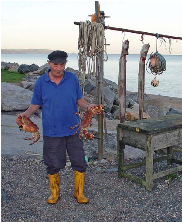
A catch ashore from local Start Bay.

A high percentage of local producers also attend local Farmers Markets in the nearby towns of Kingsbridge (6 miles), Dartmouth (9 miles) and Plymouth (26 miles). It was the feedback from producers who attended the first local festival that informed the working group to change their initial plan and that it would be beneficial to hold a Christmas Food Festival when hopefully even more people will attend.