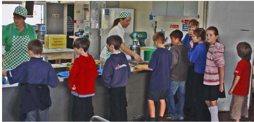
In line for a lunch of local foods