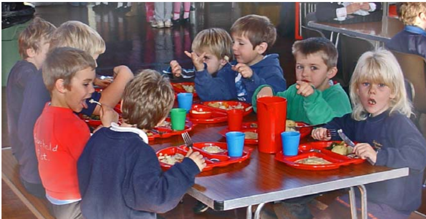
Liking local foods.